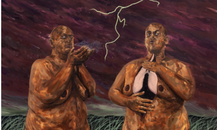
Detail - I seem to pray only when I need to the most , Oil on Canvas, 72 " x 96 ", 2024